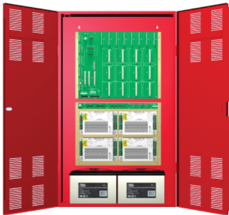
CAB-50 w/DAB-7, PS-7A's & Batteries