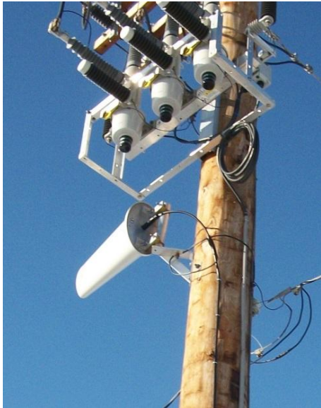
Pole Mount Installation (Reinforced Model)

The Z8A9 is a cost-effective, versatile antenna mount that can be pole or wall mounted. It is well suited for several applications including Utility SCADA and Distribution Automation, Automated Meter Reading, and other Industrial RF Communications. Other models are available including custom and reinforced models that are rated up to 170 MPH wind loading. Contact Second Sight Systems for details.