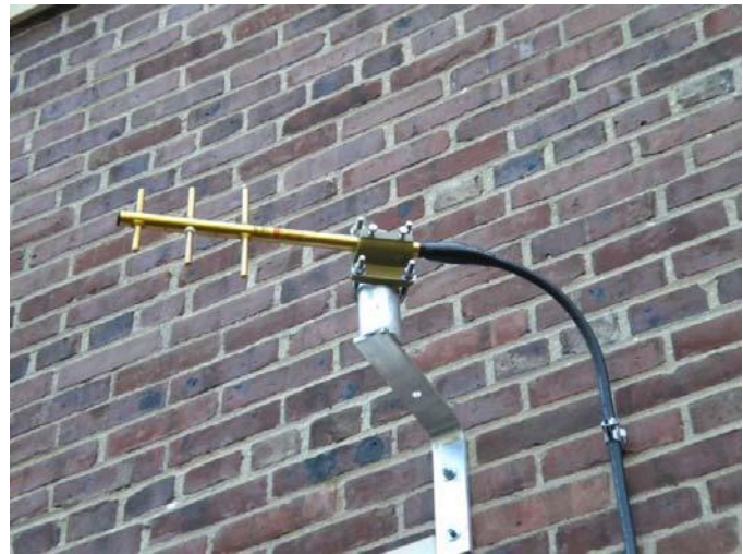
Wall Mount installation (Standard Model)